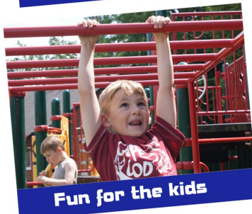
Fun for the kids