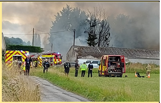
The disastrous fire that reduced Phoenix Upholstery and adjacent engineering business on Ravensden Road to a smouldering heap.